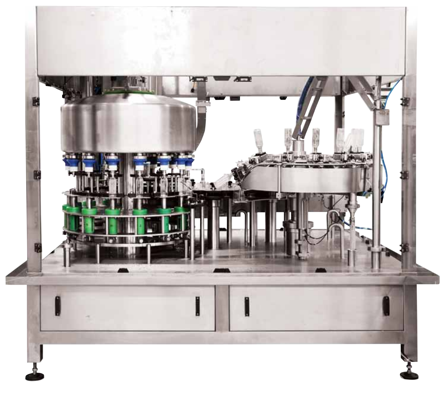
Thanks to the high level of integration and to the proven reliability of the individual machines the Filtec lines provide high output for the entire production process.