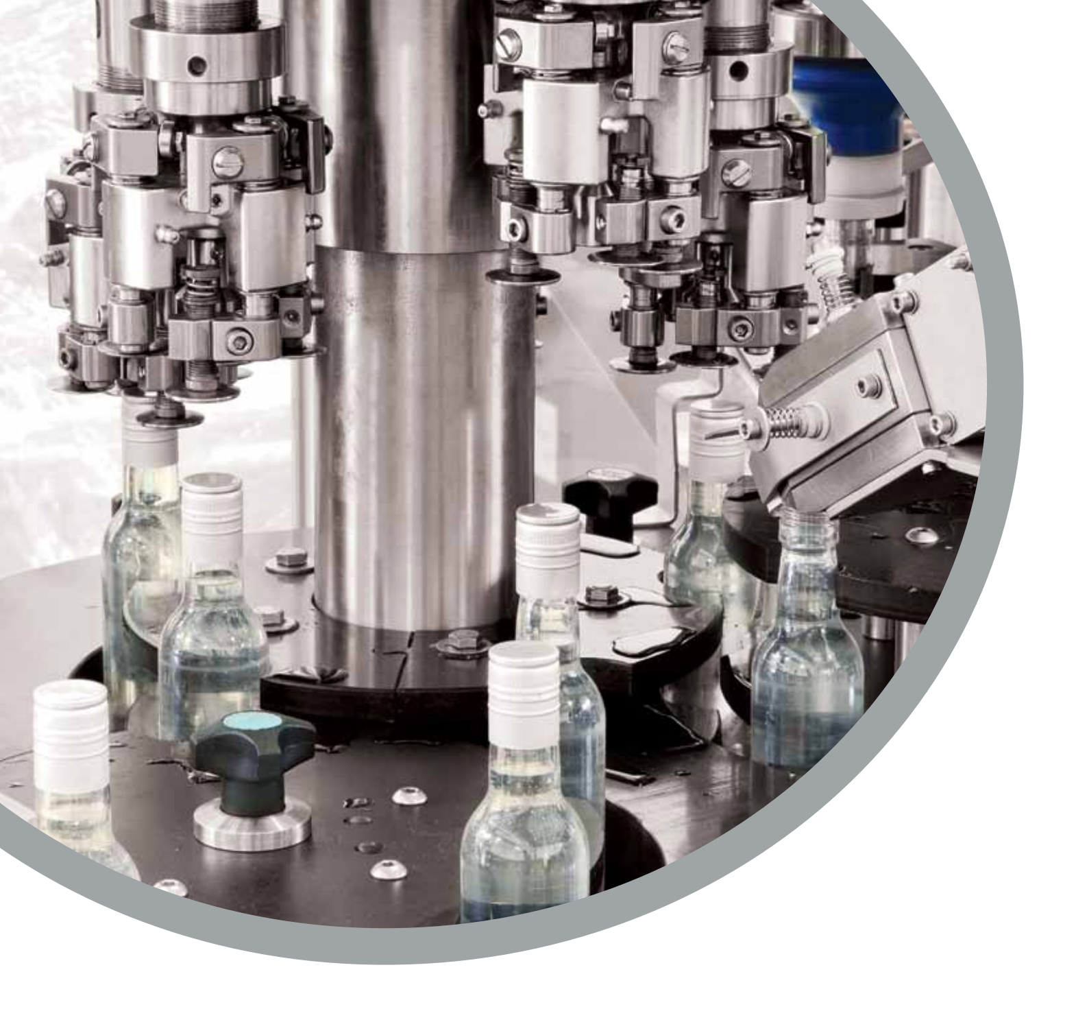
ROBUST • EFFICIENT • SAFE